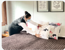
Guest House Management