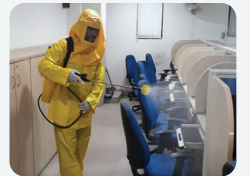
Pest Control, Sanitisation and Disinfection