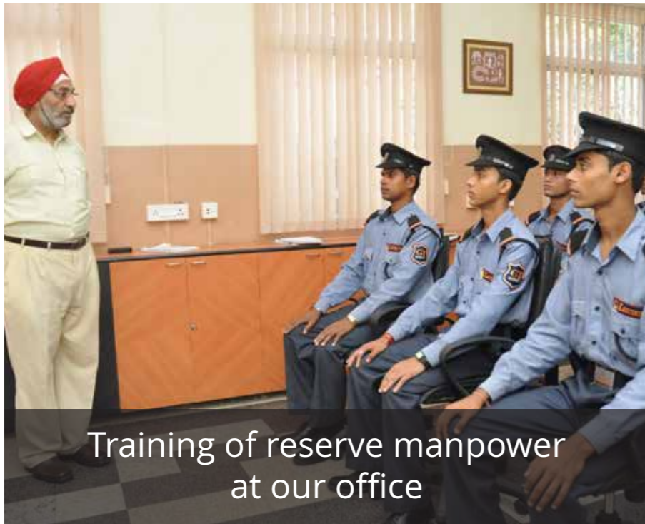
Training of reserve manpower at our office