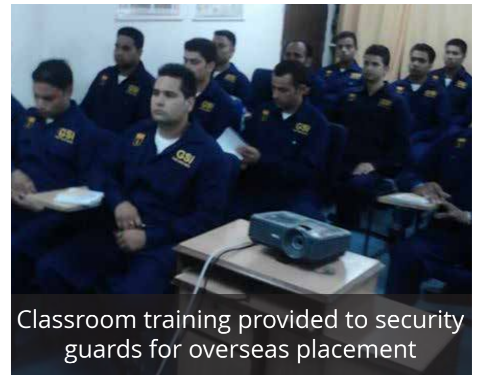
Classroom training provided to security guards for overseas placement