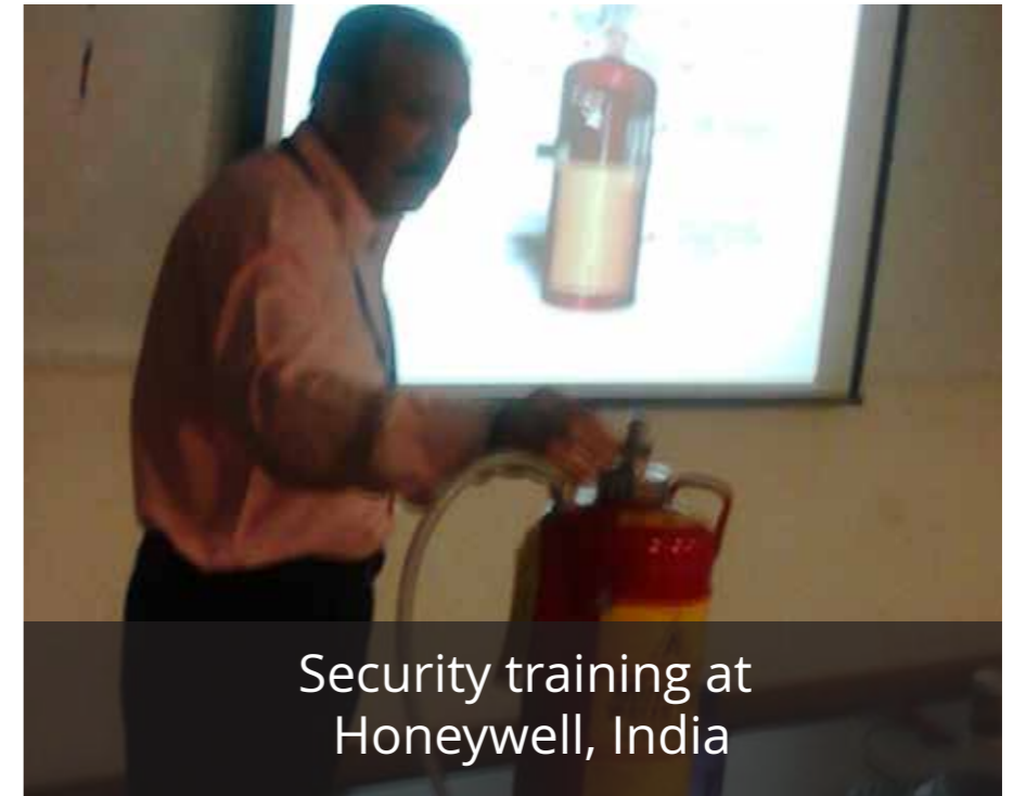
Security training at Honeywell, India