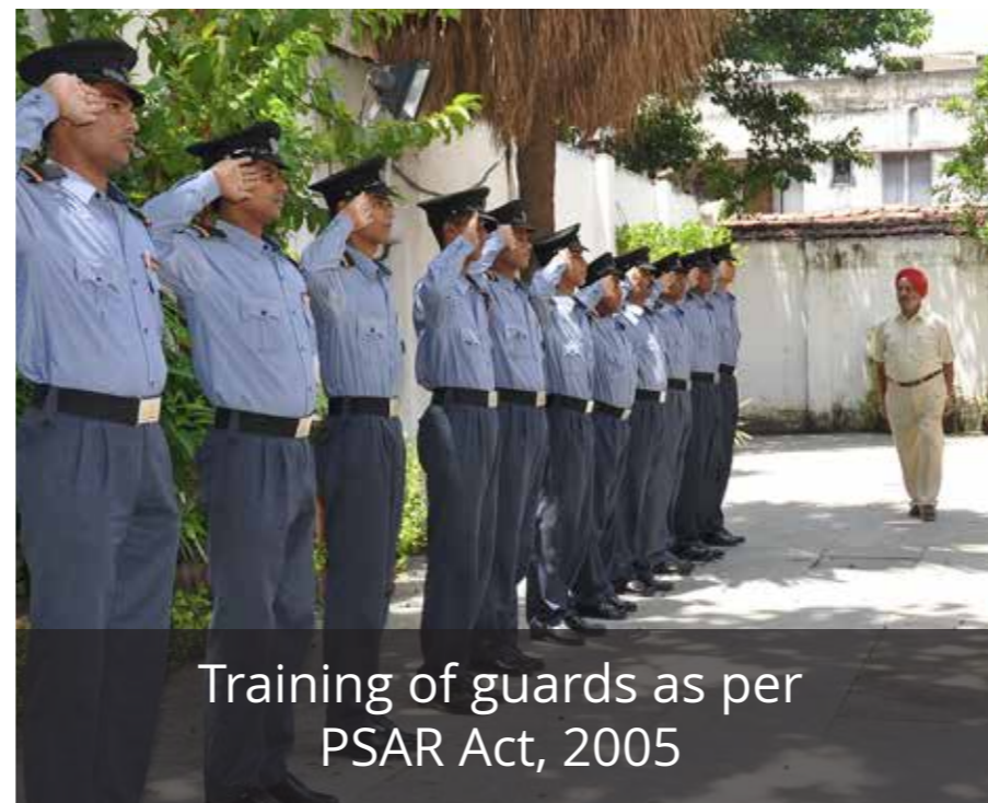
Training of guards as per PSAR Act, 2005