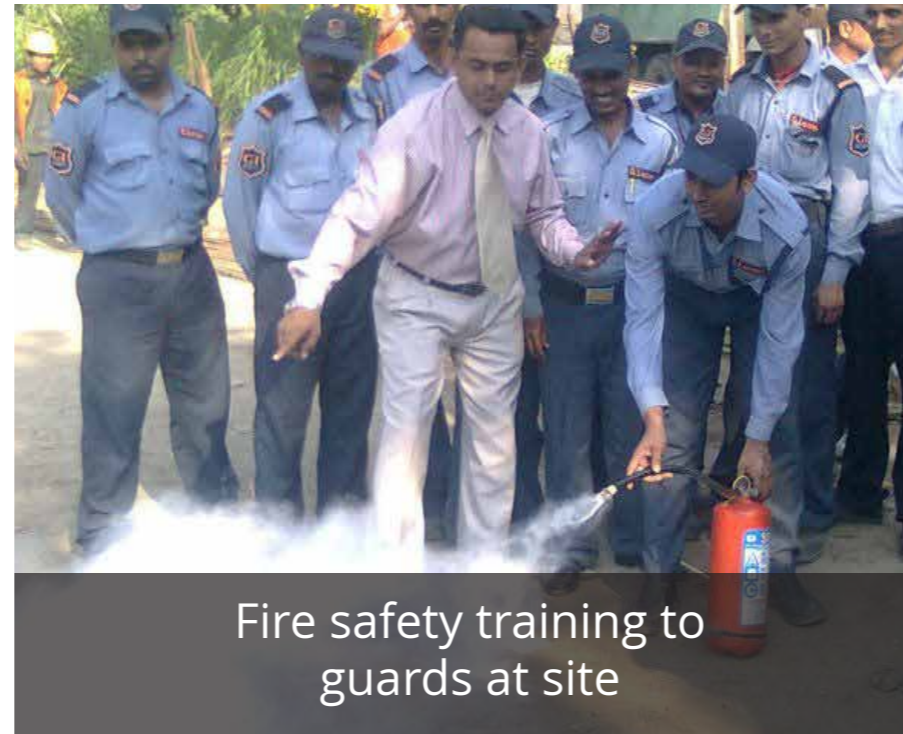
Fire safety training to guards at site