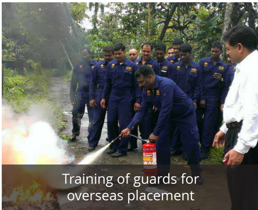
Training of guards for overseas placement